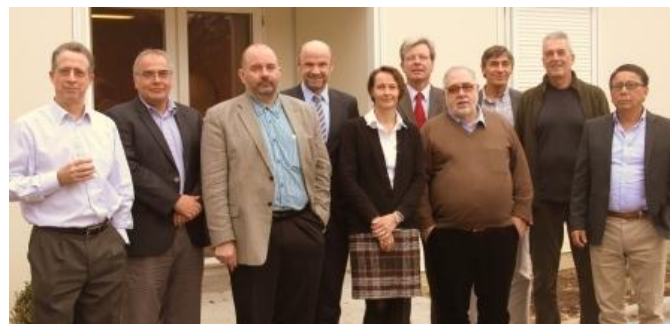
Participants of the WFSE SC meeting in Montpellier.