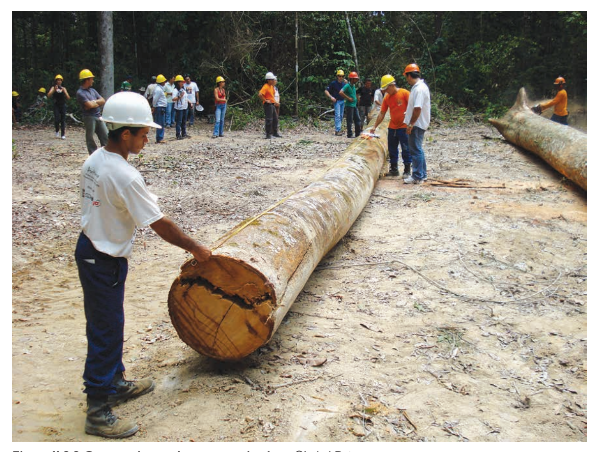
Figure II 3.3 Community workers measuring logs.

of benefit sharing from CBFM in PDS is not clear and a potential source of conflict. Moreover, communities are still vulnerable to invasion from illegal loggers: in Virola Jatobá for example, the association complained regularly about illegal extraction in their forest reserve but control and sanctions were insufficient.