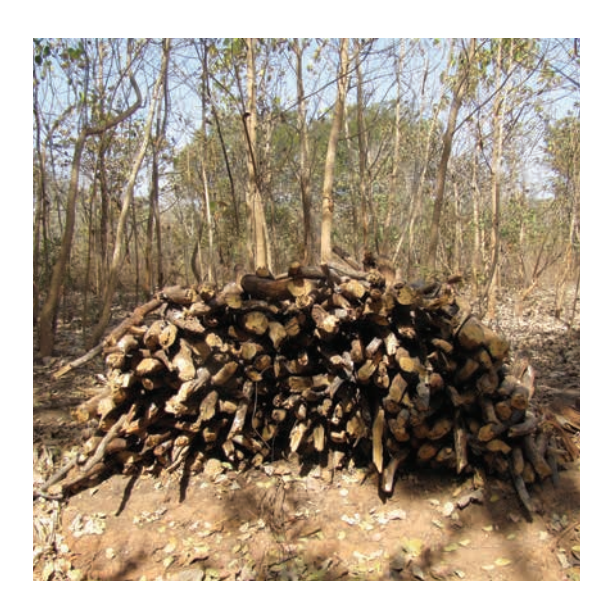
Figure II 19.1 Firewood collection adjacent to a Community Forest.

resolution, and specific forest management skills, such as controlled burning and forest monitoring. Most training is intended to be provided during the implementation period, individualised to the context and pre-existing capacity of each community forestry committee. The DoF encourages NGOs and other collaborating organisations to assist in capacity-building activities (DoF 2005). The 2010-2019 Forest Policy echoes the importance of capacity-building activities, highlighting the need to continue to develop the institutional capacity of rural communities to assume increasing responsibilities for natural resource management, through farmer training, community-based resource-management education campaigns, and the dissemination of resource management technologies, among others (Republic of The Gambia 2010).