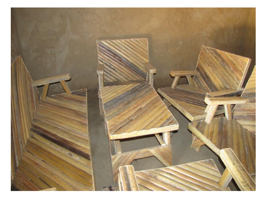
Figure II 19.3 Furniture produced with local materials by the handicrafts enterprise.