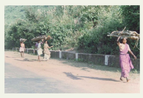
Non timber forests product collection

Volume 41, double issue 11&12/2012, page 2