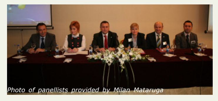
Volume 41, double issue 11&12/2012, page 3

Find the full report at: <a href="http://www.iufro.org/science/divisions/division-4/40000/activities/">http://www.iufro.org/science/divisions/division-4/40000/activities/</a>