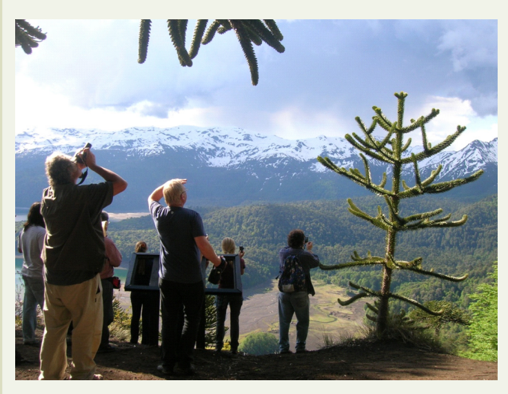
Post-conference field trip to Conguillio National Park in southern Chile

This year, for the first time, the Working Party gathered in the southern hemisphere, namely in Latin America. The region offers new challenges to forest landscape