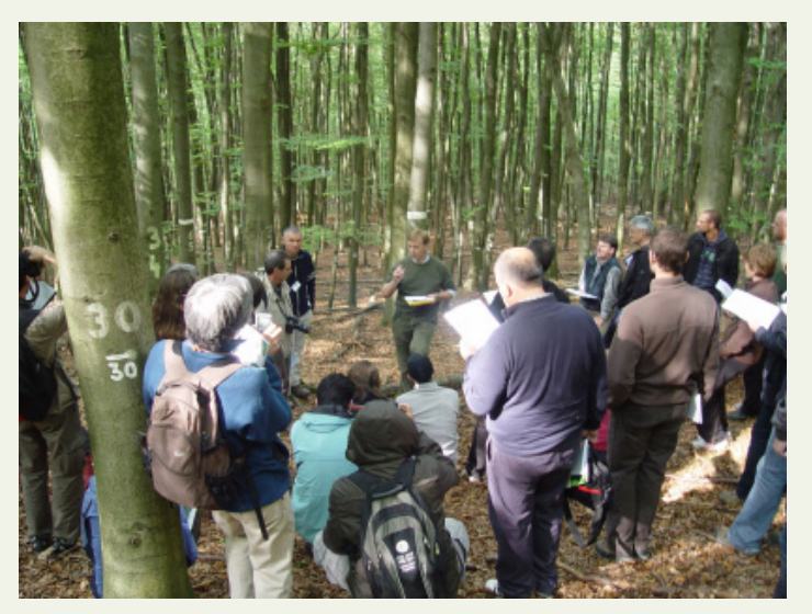
Participants visiting a beech thinning experiment in Forest District Muenden

Institute of Silviculture and Forest Protection (Tharandt), Technische Universität Dresden, Germany Sponsor: European Forest Institute (EFI)