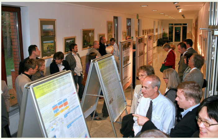
Poster session

The sustainable forest management has a vital and widely-established role in climate change mitigation. Quantifying the carbon stored in forest ecosystems, as well as the rates and direction of carbon fluxes emitted from and absorbed by forests, has become very important to improve understanding of their influence on the global carbon cycle. In many countries national programs to protect and maintain forests have been initiated with the aim of reducing net carbon emissions and to stabilize or increase terrestrial carbon stocks in the long-term.