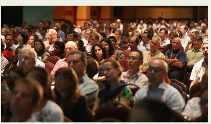
Volume 39, issue 9/2010, page 1