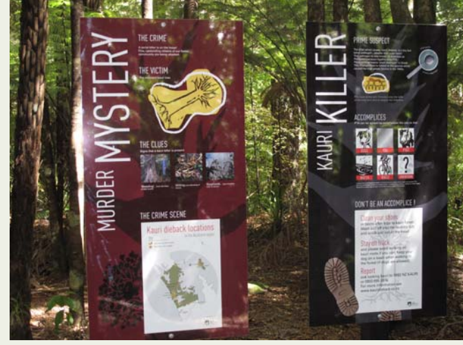
Public information signs, created by the Auckland Regional Council, warning of the dangers of Kauri dieback.

In 2010 the group met in New Zealand for the 5th time with a week-long program of field observations, formal presentations, and most valuable, open discussion. The local attraction was a "new" and lethal disease of the iconic kauri tree. This indigenous member of the Araucareaceae reaches a huge size and great age. It has been central to Mauri cosmology and life since they first discovered the islands. Now a new Phytophthora is killing the trees. As with many Phytophthoras, humans seem to be important vectors. We heard of the importance of kauri from Mauri elders and their concerns for its future, and observed vigorous efforts to limit the spread of the disease. The public information campaign was most impressive. Discussion focused on practical methods to limit spread, public participation,