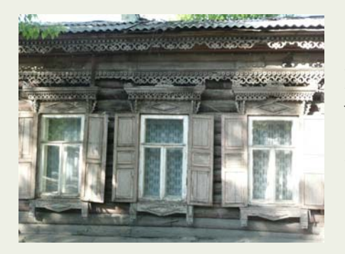
Traditional wooden building in Irkutsk, Russia

Representatives of several research institutes and colleges from Bulgaria, Kazakhstan, Kirgizstan, Mongolia, Poland, Russia, Serbia, Tajikistan and Ukraine took part in the Conference. During a special session, the scope of action, purpose, structure and the vision of development of IUFRO was presented and IUFRO information material was handed out.