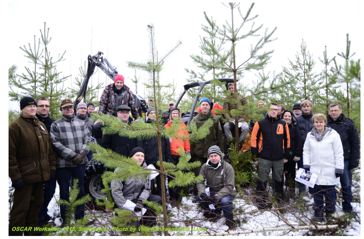
Workshop participants in a mechanically operated young pine stand.

Ongoing research projects in forest regeneration, drainage and management of young stands in the Baltic countries were also presented. An overview of the management of Latvia's state forests was followed by a state-of-the-art review of the ongoing research activities in mechanization of silviculture in Latvia. In addition, the work productivity of wood ash forest fertilization was addressed. Further