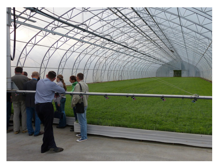
Trip to the regional Altai Forest Seed Breeding Center "Altailes"

Significant research studies and results were presented in the plenary and session talks and by means of posters. These findings are very important for the conservation of forest genetic resources in Siberia in particular, and of bo-