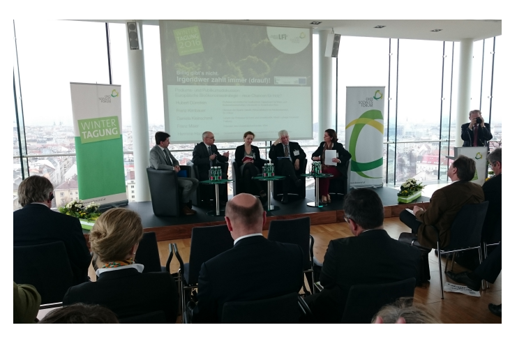
Panel discussion on European bioeconomy strategy.

One of the megatrends that we are already facing today in all sectors of life is the rapid technological development through digitalization. This development may lead to socalled "digital disruption" displacing existing goods and services and creating new markets. For the forest industry, this negative term of "digital disruption" may actually be turned into a positive concept. New technology has great potential to improve our performance, but this will, of course, require flexibility and a certain adaptive capacity. Other "disruptions" may also turn out to be opportunities for the forest sector. The so-called "clean disruption" in energy and transportation that is driven by concerns about air pollution in countries such as China can lead to a reduction of fossil fuels and increase the demand for forestry residues. The other great disruption is climate change, which severely affects forests, but for which forests are also seen as part of the solution.