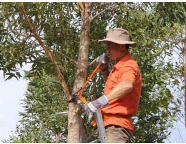
Pruning of an adolescent E.quadrangulata.

While many NZFFA members grow radiata pine, we also place a strong emphasis on special purpose species, with species-specific action groups for blackwoods, cypress, eucalypt, indigenous, and redwoods.