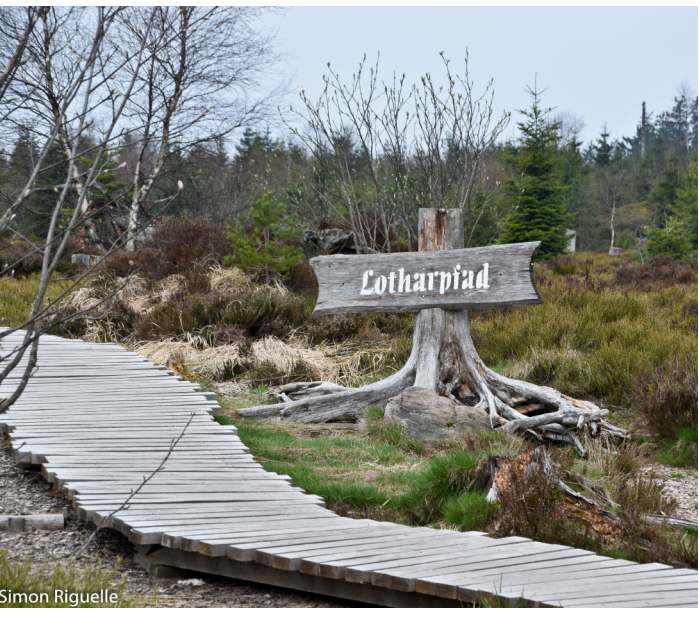
Storm damage trail in the Black Forest where storm Lothar heavily devasted forest areas in 1999.