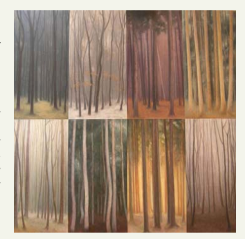
Edith Stipl, Forest Quilt III 2004 Oil on panel, 32 x 32 x 1 Inches http://www.kostuikgallery.com

In this context, harmonization – unlike standardization – is meant to facilitate comparisons between existing definitions of related terms. It collects existing definitions, establishes linkages, identifies common elements,