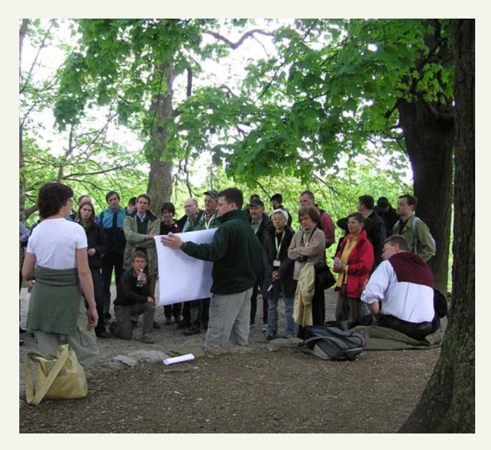
showing the forum participants during a field presentation of adapted forest management in urban forests of Ljubljana, Slovenia.

At the forum, green infrastructure, a concept more and more used in the United States and the UK, was presented as one of the more integrative ways of thinking that is needed to get the message across. For a successful branding of urban green space it should be discussed not just among forest services or city green departments, but much more in a general city policy and planning context; and it should be discussed together with city planners, health departments, etc. Urban green infrastructure should become a logical element of city planning. The need for cross-sectoral cooperation in urban forestry can also be seen from the growing number of different professionals attending the forum. Foresters are no longer the dominating group as more and more planners, arborists and landscape architects attend the forum.