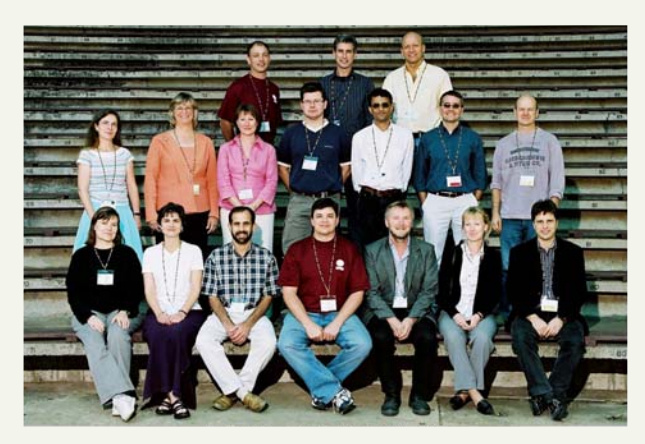
IUFRO Tree Biotechnology 2005 - Scientific Committee

With the genome data in hand, it is now possible to investigate the detailed evolution of a forest tree genome and its relationship to other plant genomes. Such comparisons allow us to ask " What genes make a tree?" and will greatly accelerate our journey towards a more complete understanding of the genes that underlie important traits in forest trees. One outcome of the post-genomic era is largescale biology and the creation of huge databases of genes, proteins and metabolites. The organization, bioinformatics and sharing of such data were a central discussion theme of the meeting. The sequencing of other tree genomes such as that of Eucalyptus species was also discussed.