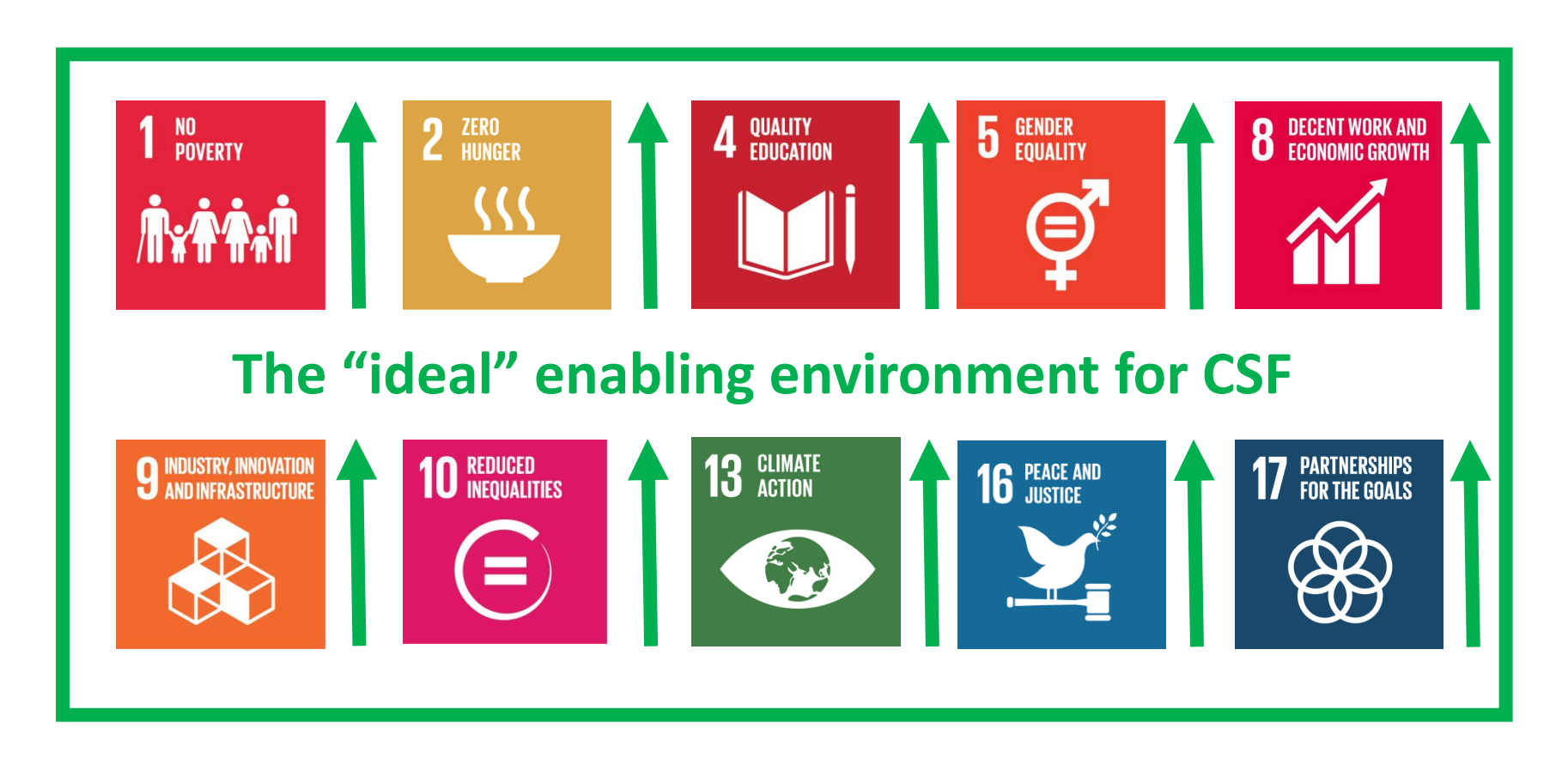
Significant progress in all conditions discussed favoring desired outcomes