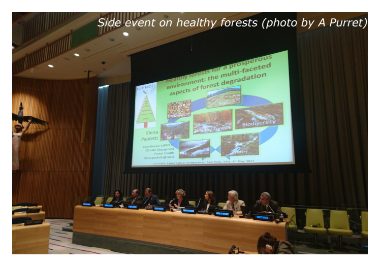
Vol. 46, issues 5&6/2017, page 1

This side event on May 1 was organized by the IUFRO Task Force on Climate Change and Forest Health. It discussed novel emergencies and global challenges such as air pollution and climate change impacts, and solutions, e.g. forest supersites and sustainable harvesting, and how to make forests more resilient against climate change, halt forest degradation and achieve healthy and functional forests.