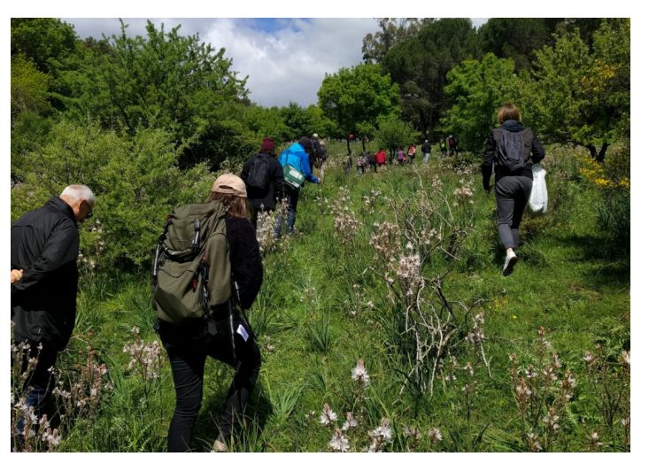
Excursion post-congress in the "Ficuzza Forest" a natural reserve characterized by the presence of: Quercus ilex, Quercus suber, Quercus pubescens, and the endemic Quercus gussonei. De-fragmentation of the oak forest has been achieved by planting Fraxinus excelsior, Acer campestre, Castanea sativa, and Celtis asperrima.

Subscribe to the Congress Newsletter: <a href="http://iufro2017.com/newsletter/">http://iufro2017.com/newsletter/</a>