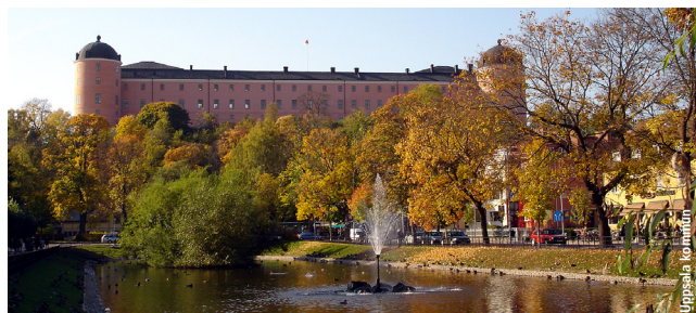
Photo: Uppsala castle from the mid-1500's

Uppsala is Sweden's fourth largest city with a population of 190 000 inhabitants. Unique cultural treasures and an exciting history are to be found in the city of knowledge and inspiration. Uppsala has retained its small-town charm while offering a big city's selection of shops, restaurants and other entertainment.