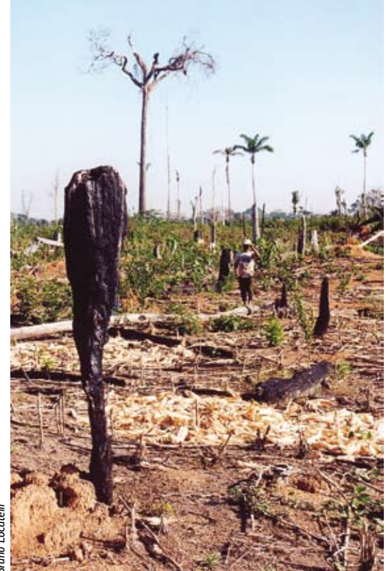
Photo 6.1 Recently deforested area in Norte do Mato Grasso, Brazil.