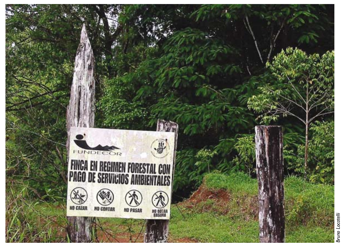
Photo 6.3 Payments for environmental services have contributed to forest conservation in Costa Rica.

other land uses contributed little to reduce the already low threat of deforestation (Pfaff et al. 2009). In all of these cases, participation of local land owners has been important to achieve the protection goals within protected areas as well as on the neighbouring private lands.