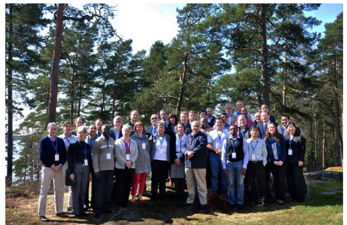
Participants of the IUFRO WFSE Workshop in Helsinki April 2012.

The workshop brought together the Editors and Convening lead authors of the case study chapters of the new book. It provided an opportunity to discuss the main aims and orientation of the book, the framework for analysing the case studies, and most importantly the proposed case studies. During two and a half days we heard a presentation of each case study. The presentations covered the different cases that focused on important themes including e.g. community forestry, land and resource rights, certification, illegal logging, conflicts, restoration, microfinance and ecosystem services. The workshop participants totalled 41. Altogether about 150 authors from research organizations and universities from around the world are involved in developing the case study analyses.