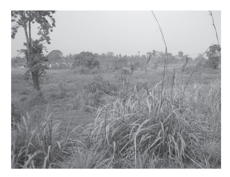
IUFRO-ITTO-REDDES Pilot Site: Degraded forest landscape in the Offinso District, Ghana.

This project is about supporting ITTO producer countries in Africa in dealing with the challenges of reducing deforestation and enhancing the rehabilitation of degraded tropical forests. In line