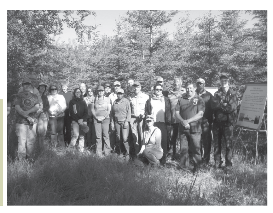
Photo: Participants of the 1.01.04 Boreal Mixedwood 2012 Conference in Edmonton, Canada.

Division 1 has 7 Research Groups and 18 Working Parties with a total number of 78 Officeholders.