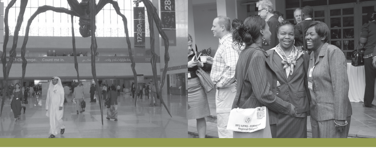
COP18 in Doha, Qatar.