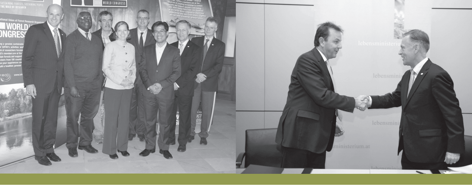
IUFRO Review Panel.