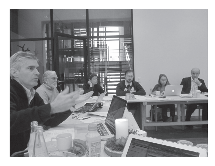
Meeting in Copenhagen.

The Task Force debated the form of these documents and selected initial topics for draft papers to be written and presented to practitioners at the next Task Force on Forest Governance mee-