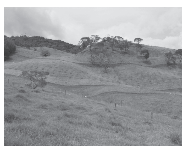
Field trip during agroforestry meeting in Colombia (IUFRO 1.04.00).

Note: All figures in the table below are given in Euro. These are the final figures before auditing.