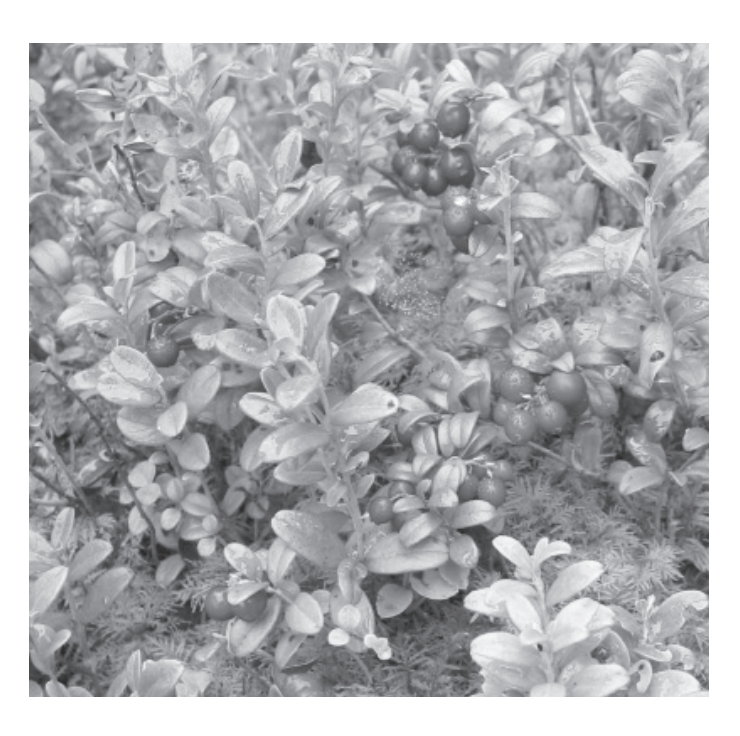
Lingonberry.

UWE Conference (University Women of Europe), Workshop Forests and Human Health and Well-being. Helsinki, Finland (co-organizer)