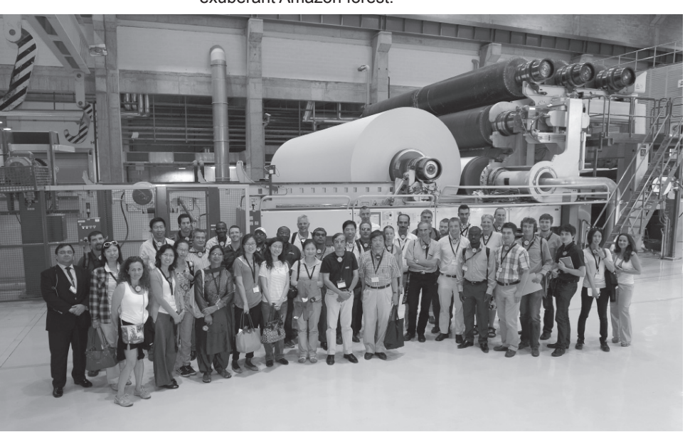
Photo from All-Division 5 Conference.

The city of Belém, capital of the state of Pará in the equatorial north of Brazil, hosted the 12th International IUFRO Wood Drying Conference (WDC 2012) from July 30 to August 3, 2012. This was the first WDC in South America, and offered a great opportunity to learn about tropical rainforest species and visit the exuberant Amazon forest.