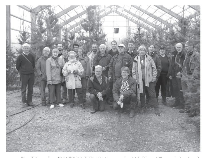
Participants of LARIX 2012, Hallormsstad National Forest, Iceland.