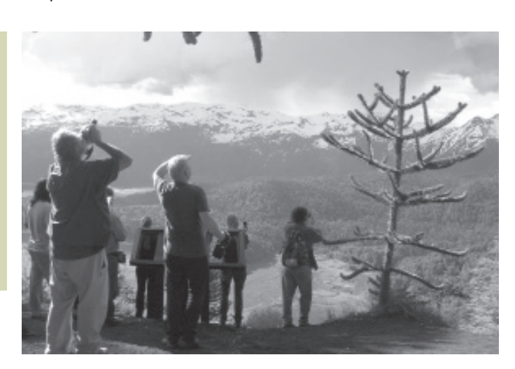
Post-conference field trip to Conguillio National Park in southern Chile.

Landscapes, forests and people: they are more closely connected than it looks. This was one of the main conclusions generated from the Biennial Conference of the IUFRO Landscape Ecology WP 8.01.02, titled Sustaining humans and forests in changing landscapes: forests, society and global change that was held in Concepción, Chile. WP 8.01.02 counts 640 members and seeks to promote and facilitate the application of landscape ecology concepts in the policies and practices of forested landscapes worldwide.