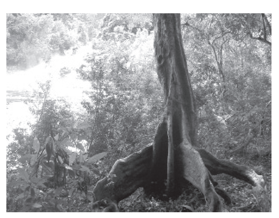
Parc National de l'Ivindo, Gabon.