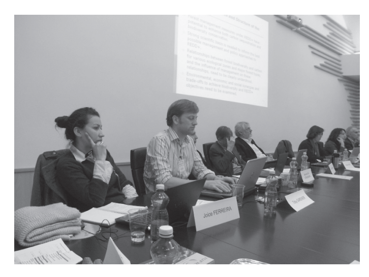
Meeting of panel members in Rome.

The report's interlinked chapters examine the relationship between biodiversity, carbon and ecosystem services in forests and related impacts of deforestation and degradation; analyze the impacts of various management approaches and specific actions