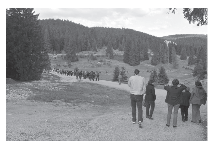
IUFRO Division 9 Conference excursion to Mt. Igman.

The conference covered the diversity of social science perspectives of Division 9. It included activities of the majority of the seven Research Groups and 21 Working Parties. The coverage of not only pure sciences but also of related perspectives of practitioners by focusing on communication and legal aspects, for example, has been identified as a major strength of Division 9.