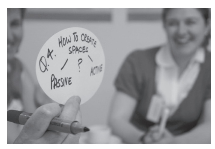
Group exercise at Urban Forestry Conference.

The 'Urban Forestry Conference 2012 – Forests and Parks: Communicating Messages for Sustainability', held in Kuching, Sarawak, Malaysia, provided opportunities for collaboration and information sharing on urban forest and park development and management towards sustainability.