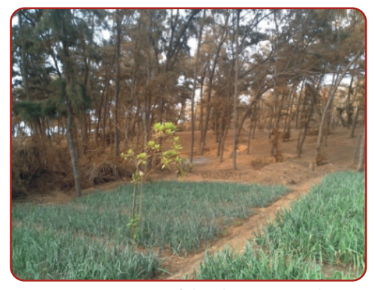
Figure 1. Casuarina equisetifolia plantation with onion crop in Niayes region, Senegal

Casuarina equisetifolia plantations in Niayes region act as windbreaks, stabilize sand dunes and improve soil fertility. Niayes is the largest vegetable-producing region in Senegal fulfilling needs of Dakar City. In this region, farmers are able to grow vegetable crops only with the protection provided by Casuarina plantations (Fig. 1). Litter fall and biological nitrogen fixation from Casuarina trees improve soil fertility and thereby increasing vegetable production. Sustaining and increasing vegetable production in this region depends on the services to be provided by Casuarina trees. New plantation techniques need to be developed to replace the existing Casuarina plantations that are more than 60 years old to