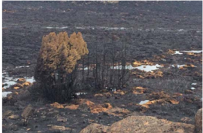
Bushfire-devastated forests in the World Heritage area of Tasmania, 2016.

“These include, for example, drought and fires in the Amazon rainforest and extensive dieback in boreal forests. These changes are important not only for the ecosystem services that are derived from these and other forests, but also for the role that these forests play in the functioning of the Earth System as a whole,” Dr. Steffen said.