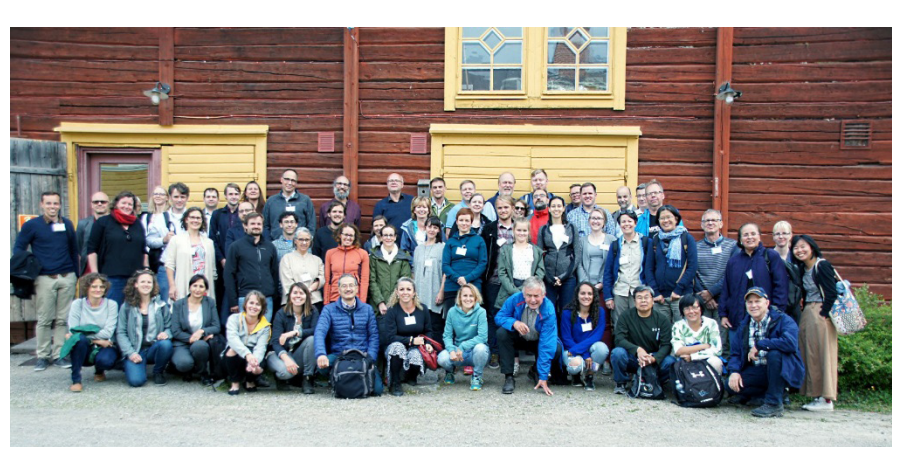
Group photo, Sulva, Finland.

IUFRO 3.08.00 will have its next conference in Duluth, MN, USA on 8-10 July 2019: <a href="http://iufrossf.umn.edu">http://iufrossf.umn.edu</a>