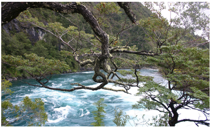
Perez Rosales National Park - Chile.

The Global Forest Expert Panel (GFEP) on Forests and Water has finalized its comprehensive scientific assessment and produced a publication under the title: "Forest and Water on a Changing Planet: Vulnerability, Adaptation and Governance Opportunities. A Global Assessment Report". GFEP is an initiative of the Collaborative Partnership on Forests (CPF) led by the International Union of Forest Research Organizations (IUFRO).