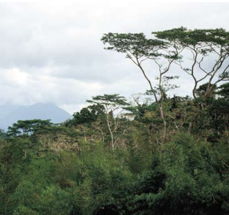
FAO/REF FO-5680/PATRICK DURST

There are three options for an institution that would serve both as a global-level clearing house for forest-focused and forest-related research and as a learning and a dialog platform to strengthen and coordinate policy learning and consensus building between different stakeholders, including policy makers, practitioners, scientists, and the civil society.