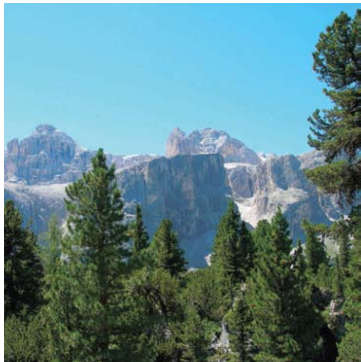
FA0/REF F0-6875/JIM BALL