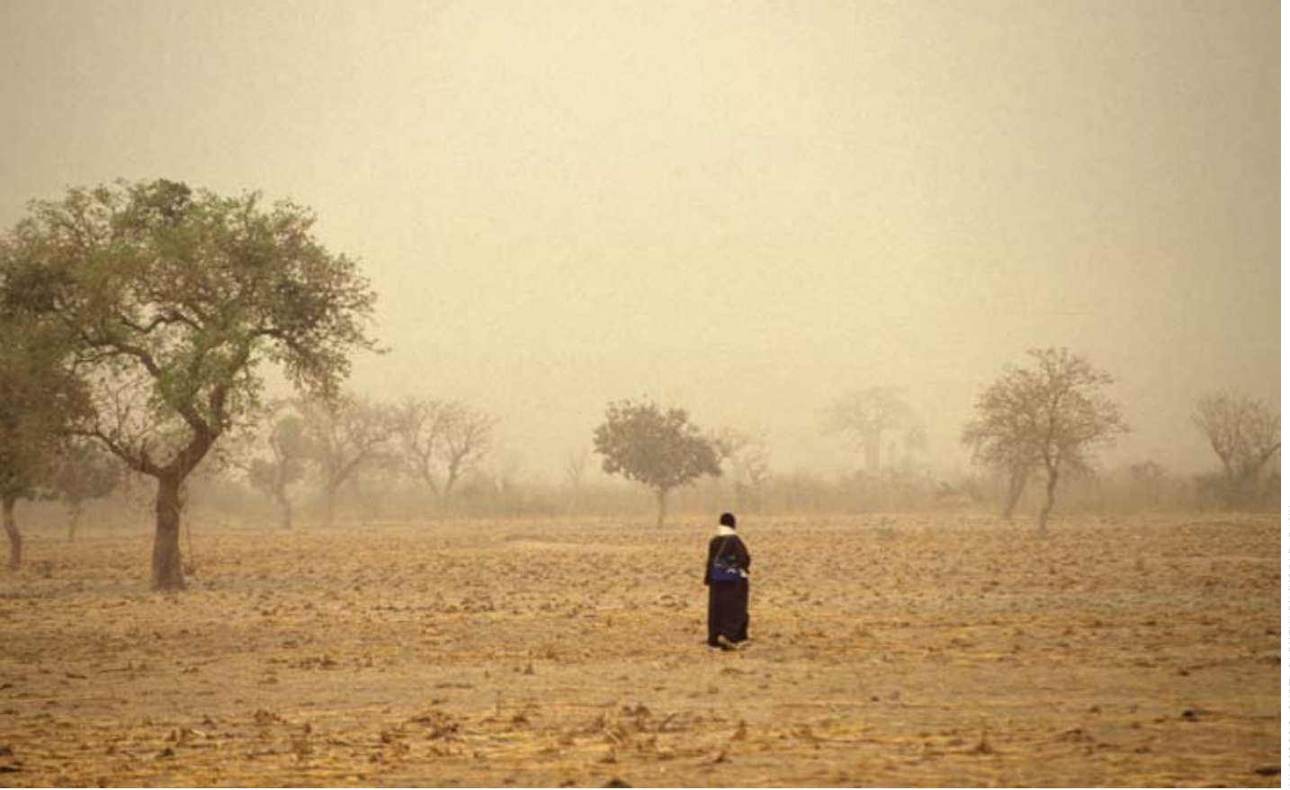
ML020506 CURT CARNEMARK/WORLD BANK