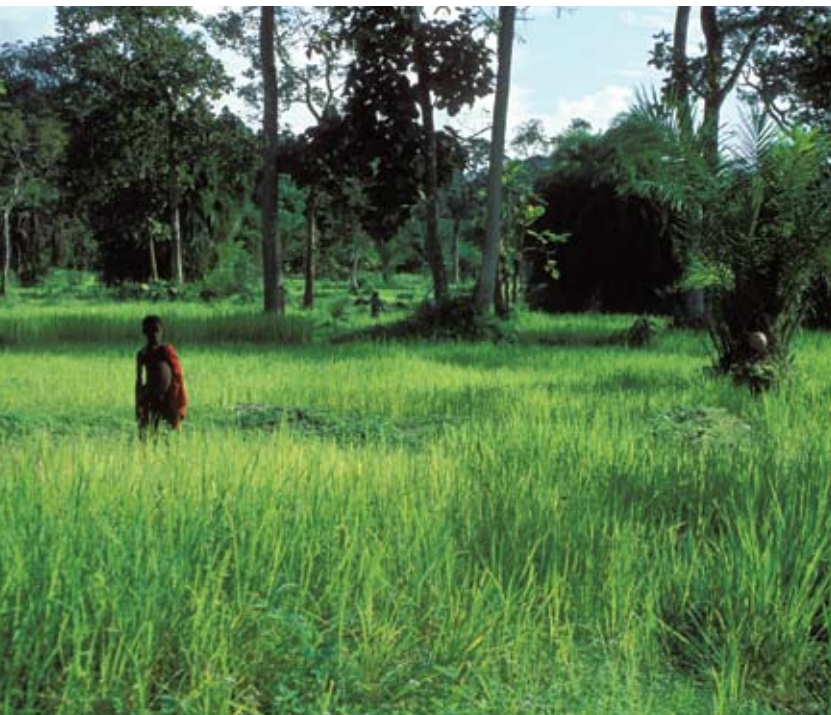
GH13S01 CURT CARNEMARK/WORLD BANK